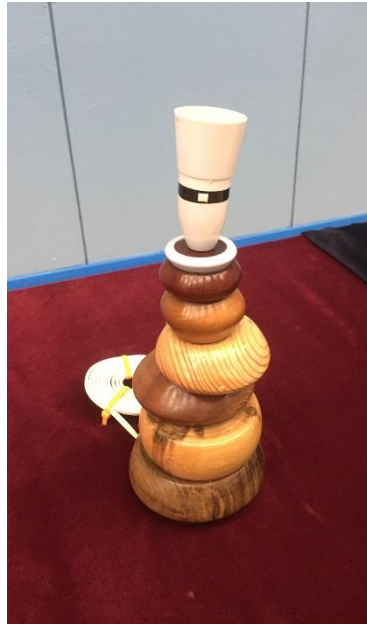
2 nd Nigel Batten