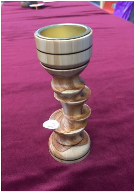
1 st Alan Brooks