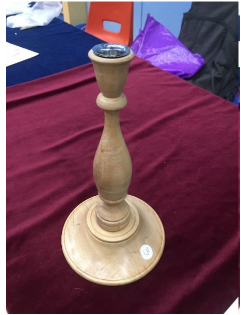
3 rd Gerry Lewis